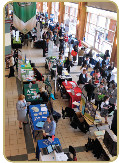
Spring Career Expo

The SCPD will help you find an internship. One of the best ways you can gain a competitive advantage in the workplace is to complete an internship as an undergraduate business student. Internships are not only great for your resume, but help you gain business experience that applies what you are learning in class to the real world. There are many resources on campus to help you discover an internship that interests you.